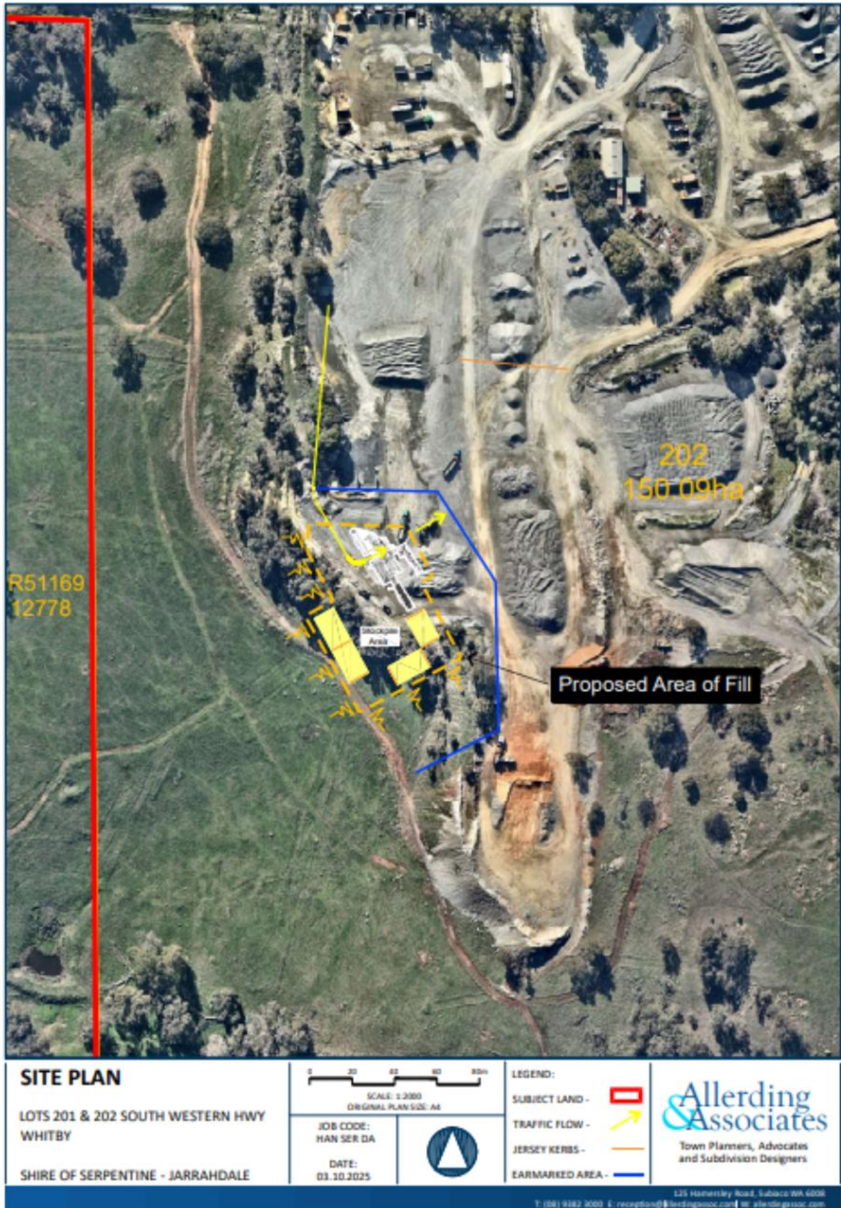
Figure 2: Location of proposed infrastructure on premises